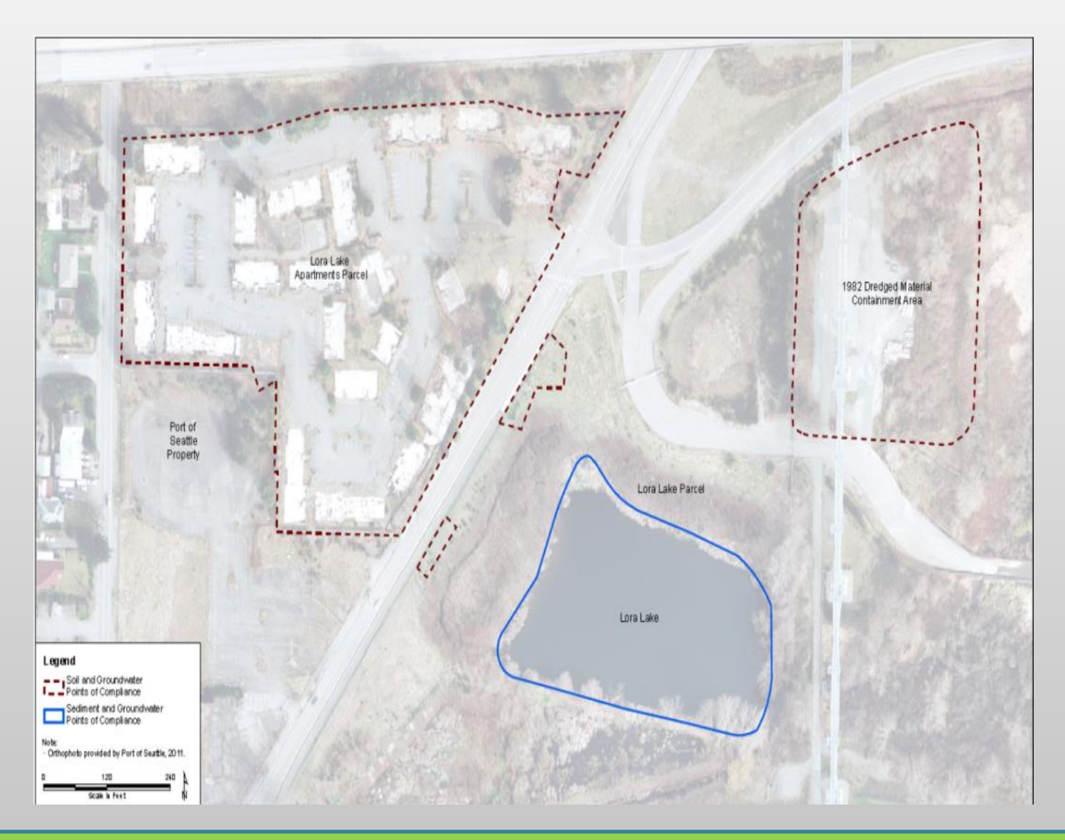
Points of Compliance