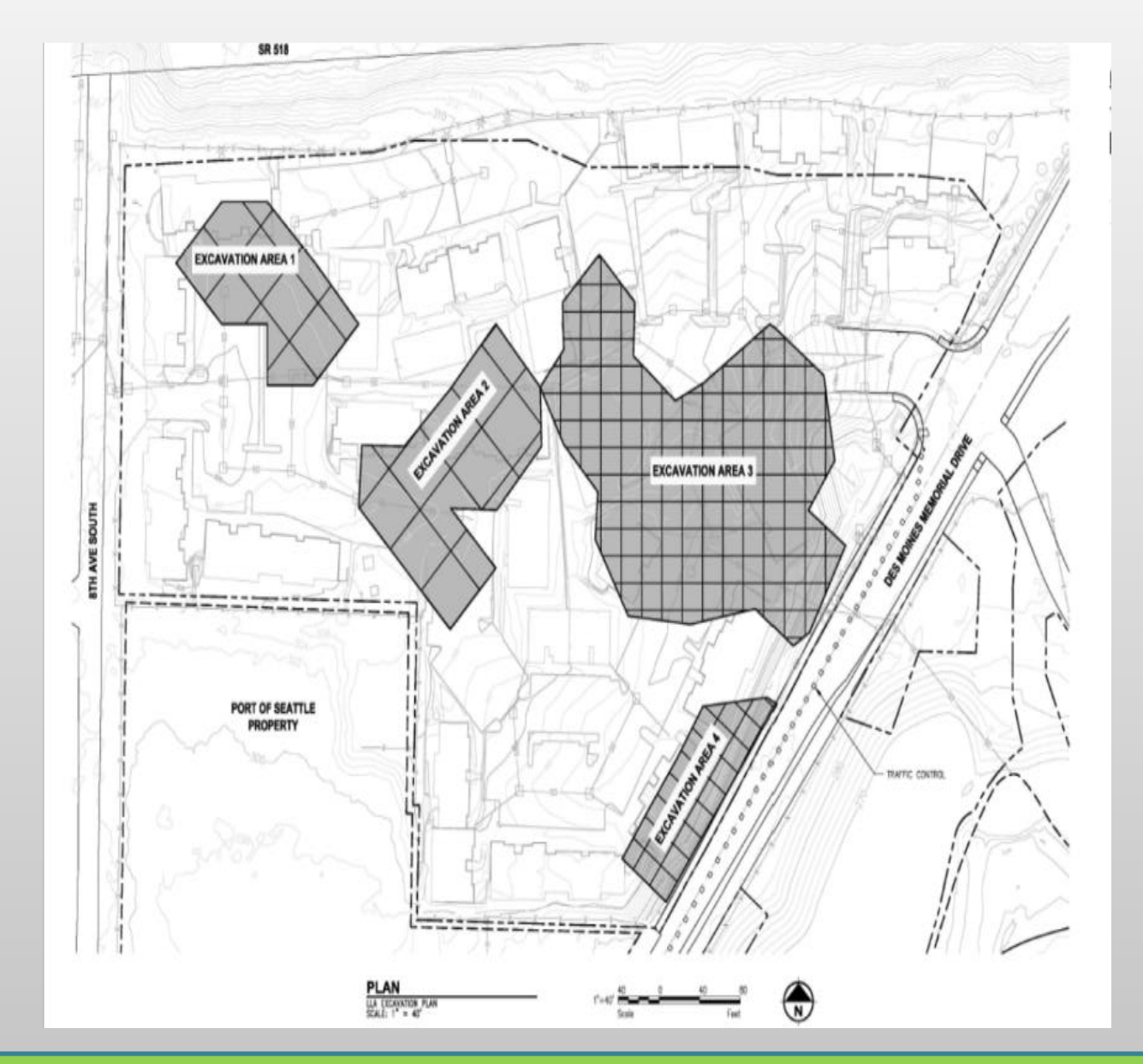
Lora Lake Apartments Parcel Excavation Plan